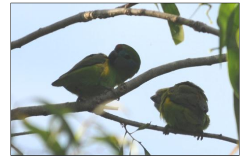
Fig Parrots - it was too early in the morning for a good photo

The billboard showing the Cape York Peninsula Road – all roads open – was exciting: Australia's Last Frontier beckoned. We rose steadily through the mountains - past the towns of Mt Molloy and Mt Carbine, and then Palmer