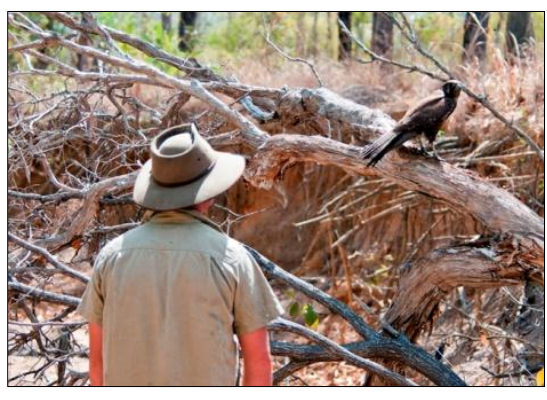
James the Falcon Whisperer?

As we moved further on we passed through about 3 kms of burnt grassland which lead to an area which had more fires still burning. We decided to turn back in case the fire sprang up and cut us off from our return route.