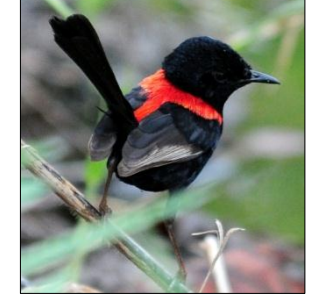
A gorgeous male Redbacked Fairy-wren

On the way back we came across a new born calf resting under a fence line on our left. Its mother was on the right behind the wire so we carried it across and witnessed a warm reunion.